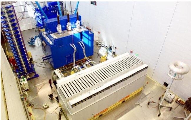
Picture 3 Power transformer with ester insulation and heat exchanging device in the test field

The utilization of losses through heat recovery can further maximize the overall efficiency of a transformer. Our experience with heat recovery applications helps our customers to make good use of transformation losses up to the highest power ratings. The usable temperature ranges for heat recovery can be extended by using heat pumps or alternative insulating liquids such as esters.