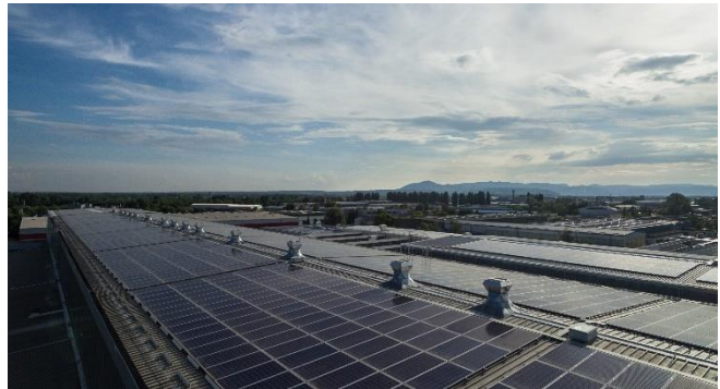
Picture 2 Photovoltaic panels on the roof of our factory in Zagreb, Croatia

But our journey towards a sustainable future doesn't end with decarbonization. By reducing water consumption and creating large green areas at our sites, Siemens Energy preserves the local environment and biodiversity. At the same time, the automation of lighting and heating systems reduces our power consumption. And by reusing or eliminating packaging materials altogether, we reduce production-related waste. While we optimize and decarbonize the manufacturing of power transformers with state-of-the-art technologies and innovations, our power transformers are also contributing to sustainability themselves, by enabling the feed-in of renewable energies and displaying special ecological features.