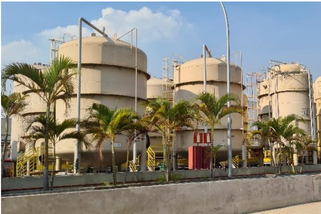
Picture 1 Oil purification in our factory in Jundiaí, Brazil

The insulation oil is an integral part of every power transformer and is subject to several aging and degradation processes. As a result, the formation of polar components often prevented insulation oil from being reused in the past. A team at the Siemens Energy power transformer factory in Jundiaí, Brazil has invented an innovative oil purification process that removes these polar components, restoring the insulation oil to its original state and making it reusable. The purification and reutilization of more than 300.000 liters of oil each year reduces CO 2 emissions by 770 tons in Brazil alone. Several Siemens Energy power transformer factories around the world have already implemented this insulation oil purification process, further decreasing the carbon footprint of our manufacturing network.