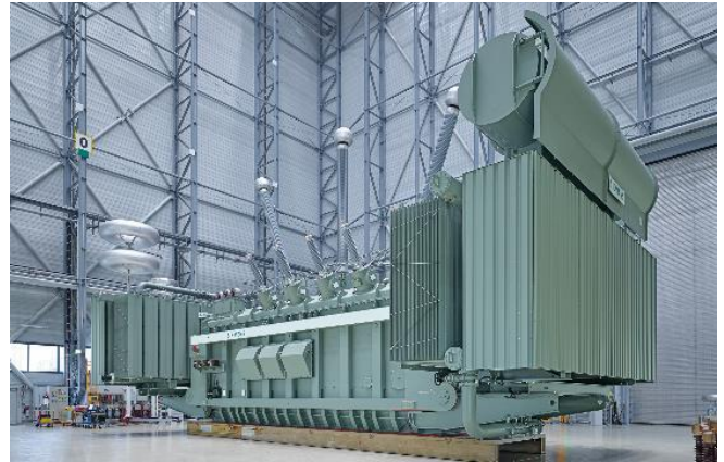
Picture 4 World's first 400MVA, 420kV transformer filled with natural Ester for Kupferzell, TransnetBW

allows cold starting at very low temperatures and offers several end-of-life options, including regeneration and full recycling. By using biodegradable insulation liquids, such as esters, harmful effects on ground water and the surrounding area are prevented.